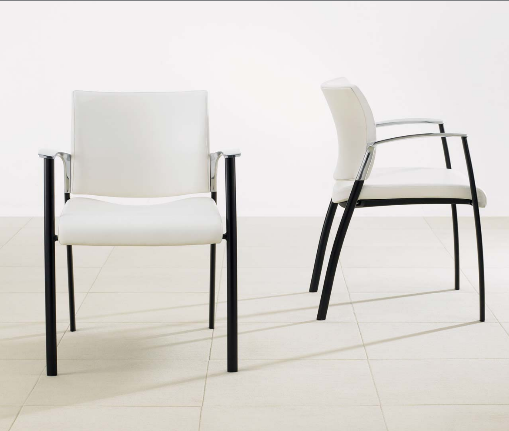
^ MODELS: Exposed plastic outer back UPHOLSTERY: Leather, White FRAME/ARMS: Ebony